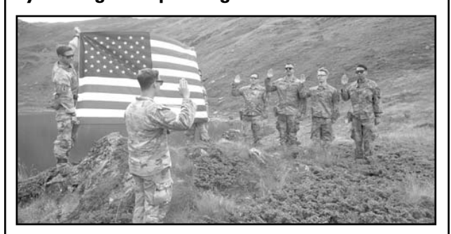
U.S. Soldiers of the 1/143rd INF ABN deployed with the KFOR mission conduct a reenlistment and promotion ceremony for their Soldiers at Landing Zone Lake, Kosovo, Aug. 14, 2023.