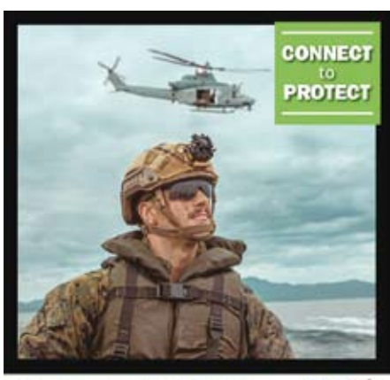
HEALTH IS HEALTH

Studies have also found that some online activities can worsen vour mental health. Passively watching what others are doing online can make you feel more isolated. You might feel you're missing out or