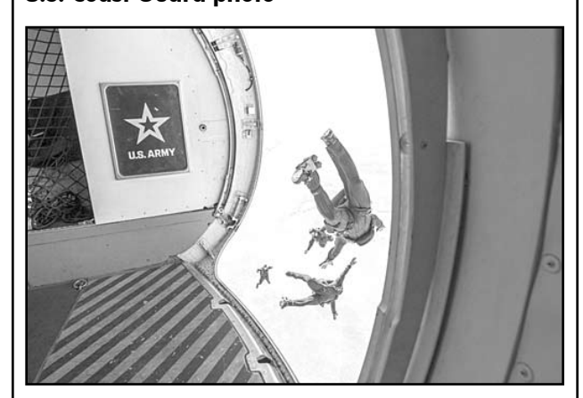
Golden Free Fall: The Army Golden Knights Aerial Demonstration Team take to the skies over Gowen Field for the Gowen Thunder Airshow and Open House, Boise, Idaho, Aug. 26-27, 2023. Many of the Golden Knights individually have performed over 3,000 jumps.